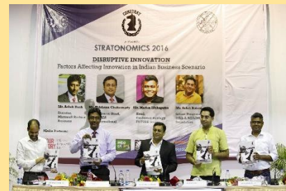
The speakers unveiling 'Strategist 2016', the Annual Business magazine of Constat: The Consulting & Strategy Consortium of XIMB